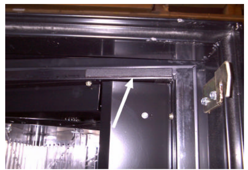
Attach Magnetic Gauge on the top of the mating strip as shown. This photograph displays magnetic strip attached for the right mating surface; the left side is attached in the same manner.